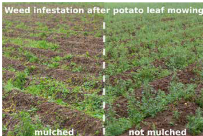
Effects of mulching on weed infestation in early August 2015.