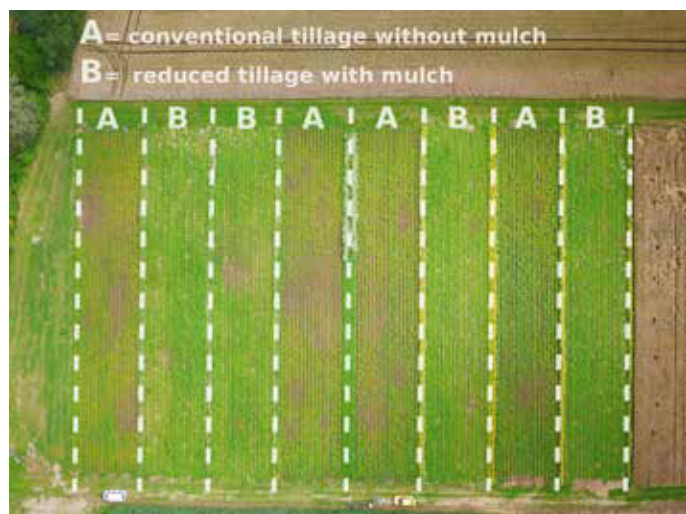
Aerial photo of the plots July 14 2014 during the late blight epidemic.

In 2014, we had a 'normal' late blight epidemic starting in early July. Spread of blight across the mulched treatments was slower by about two weeks, and cumulative disease as expressed in the area under the disease progress curve (AUDPC) was 880 under mulch and 1330 in the ploughed plots (Hohls et al. 2015). The most likely explanation for the reduction of late blight in the mulched plots is that overall the temperatures in the canopy are higher during the day due to the reflection of light by the dried mulch, resulting in a non-conductive microclimate for germination of the late blight sporangia. We could feel the differences in temperature in the field and have measured these in other experiments before, but not in these experiments.