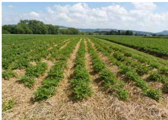
June 6, 2014: the mulched potatoes in the foreground are less lush and green than the ploughed potatoes in the background.

In 2014 and 2015 potatoes were grown as second main crop. Several practitioners of minimum tillage in organic farming had reported to us that combining reduced tillage with a thick layer of fresh green mulch reduced late blight and Colorado potato beetle ( thankfully the latter is not a problem in the UK - Ed ) in potatoes. Potatoes were planted in all plots. In the ploughed plots they were regularly ridged, whereas in the non-inversion system they were mulched. The mulch was applied as soon as possible after the first ridging in early to mid-May, and consisted of about 5kg/m 2 of a freshly cut winter pea/rye or vetch/triticale mixture in 2014 and 2015 respectively, that was shredded to about 10cm pieces. Application was done with a simple manure spreader.