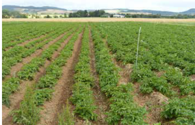
8 July, 2015: Potatoes in the ploughed treatments (left) suffered severe drought but not in the minimum tilled and mulched treatments.

The weather conditions in the two years were extremely variable. In 2014, water availability was normal to high in spring, and the summer temperatures were the highest in more than 100 years. In 2015, the spring was very cool and dry with extreme drought in May, followed by normal summer temperatures. This affected the potatoes very differently. In 2014, mulched potatoes were