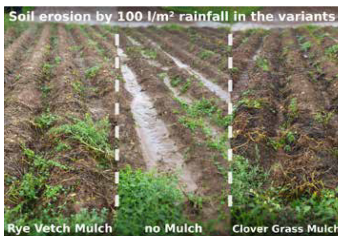
Effects of mulching on late season erosion after defoliation in August 2015.