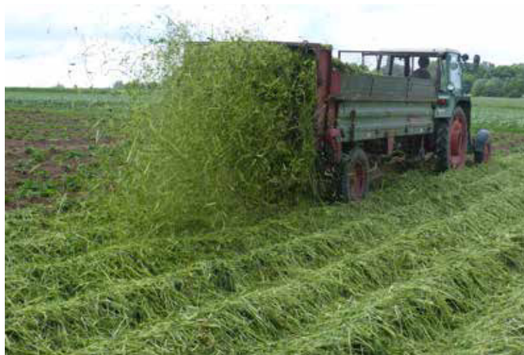
Application of freshly-cut mulch materials in mid-May with a manure spreader to 8-10 cm depth on the potato plots.

All experiments started with two years of grass/clover, after which the differential tillage methods (ploughing to 25-30cm depth versus simple non-inversion tillage by grubbing the soil to about 12-15cm depth) were applied, before sowing winter wheat in 2012 and 2013 respectively. A first compost application at 5t dry matter ha -2 was made to the wheat; this is the maximum average amount allowed per year in Germany. Wheat was grown either with a living mulch of under-sown white or subterranean clover, or without living mulch. The clovers were left to grow together with spontaneous vegetation or without further tillage. Where no living mulch was grown either summer vetch or a black oat/tillage radish mix was grown as winter cover crop.